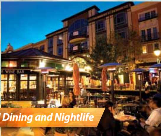
Local Dining and Nightlife