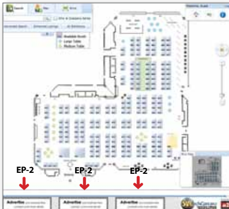
Interactive Exhibit Floor Plan