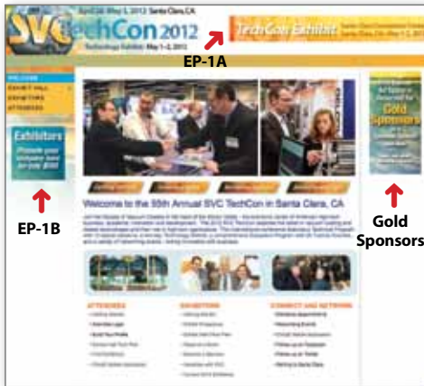
Exhibit Web Site Welcome Page