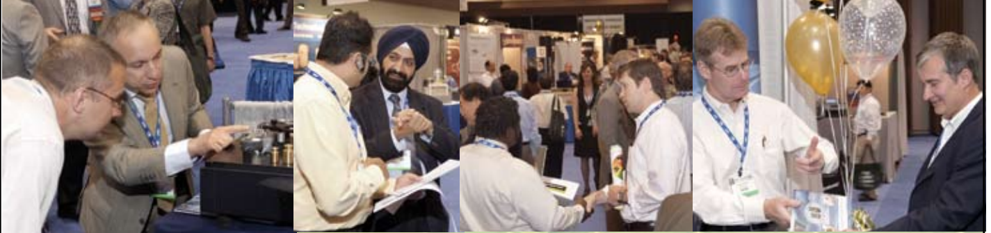
Exhibit in Orlando at the Vacuum Coating Show of the Year!

April 17–22, 2010 • Orlando World Center Marriott Resort and Convention Center • Orlando, FL